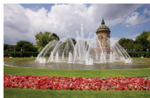
Cleveland Hall front Entrance

The front entrance to the Cleveland Hall neighborhood has had several changes over the years. The board is trying to make it inviting while working within a very small area. The challenge has been the amount of space between the brick wall and the sidewalk. We will continue to explore ways to improve our entrance.